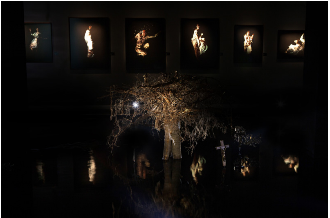
' Floating Cemetery ' black water installation for the exhibition ' Rastvorennaya Pehcal '; Moscow 2014